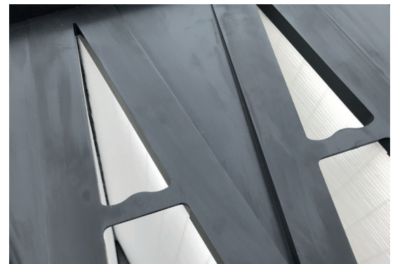
Easy carry handles