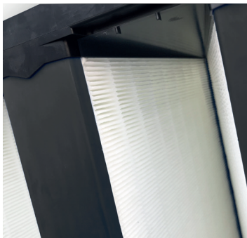
Mini pleat media

The V-Bank's frame is equipped with removal handles. The handles incorporated in the frame allow for ease of handling and filter removal. The frame is also fully incinerable.